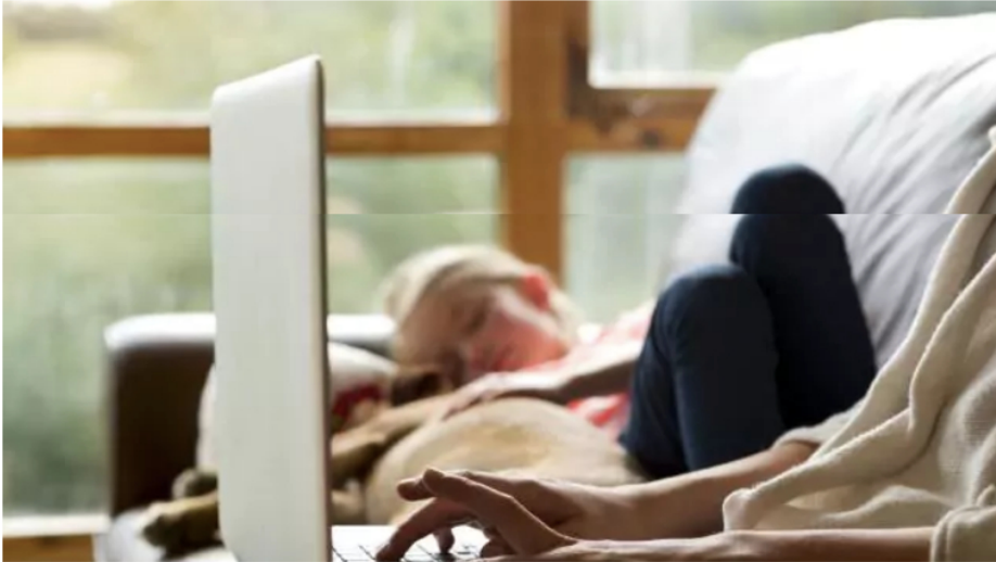
Raising kids alone is not easy, without restrictions like this.

Any mother trying to raise strong, confident and independent girls knows you are already up against it. You're fighting against a world that every day sends your daughters the message that who they are is not good enough. They are not pretty enough; they are less valuable in the workplace; they are only as significant as their significant other.