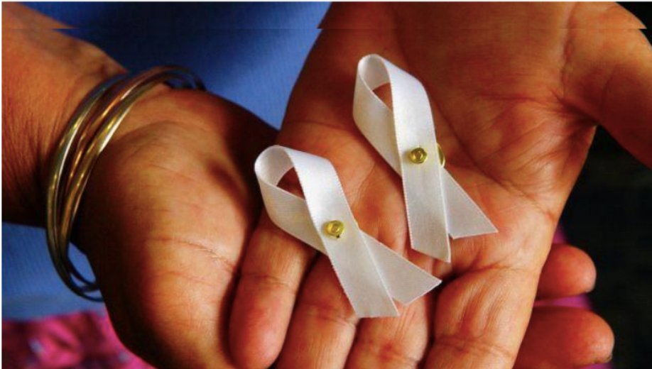
There are fears the new rules will make it harder for women to escape abusive relationships.