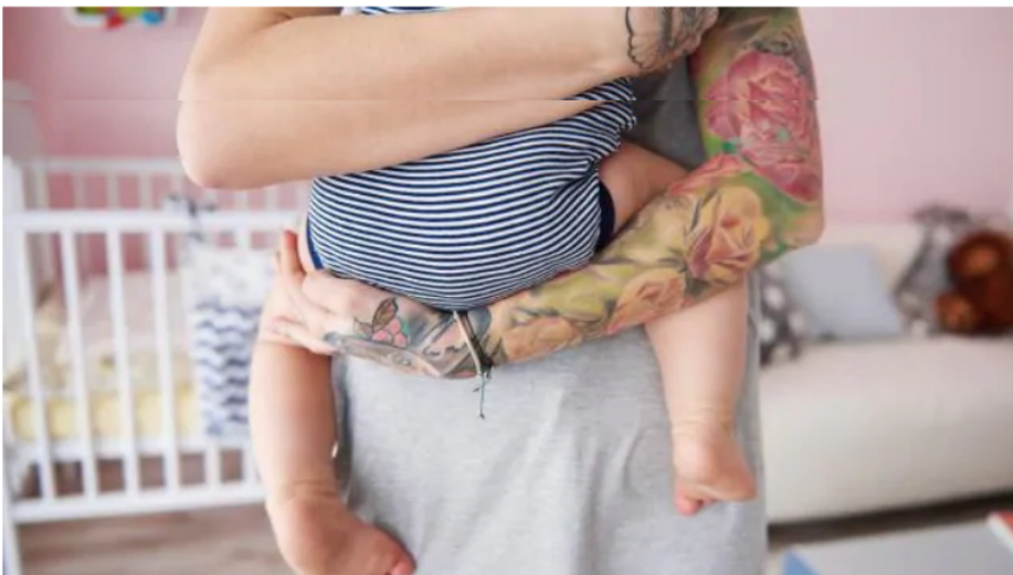
Another move to shame and humiliate single mothers.